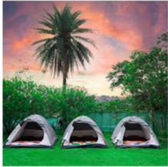
ACCOMMODATIONS & TENT STAYS