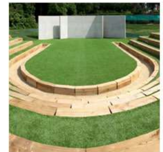
OPEN AIR THEATRE