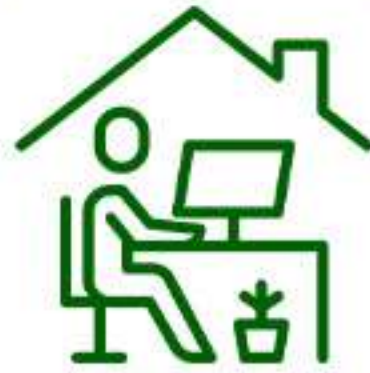
WORK FROM FARM