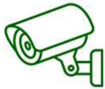
24/7 CCTV SURVEILLANCE